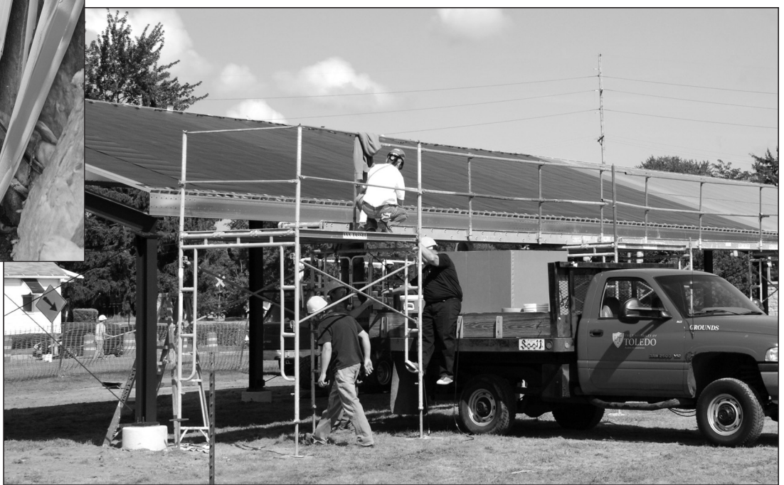
Workers installed a solar array in September on the Scott Park Campus of Energy and Innovation.