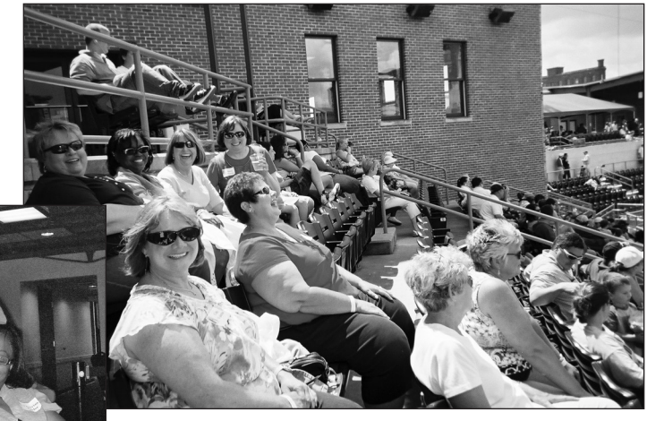
Play ball! It was a great day for a Mud Hens game. Picnic lunch and a visit from Muddy was enjoyed in The Roost.

In our next TowerTalk, you will get all the information regarding the bus trip to Boston. It's sure to be a winner!