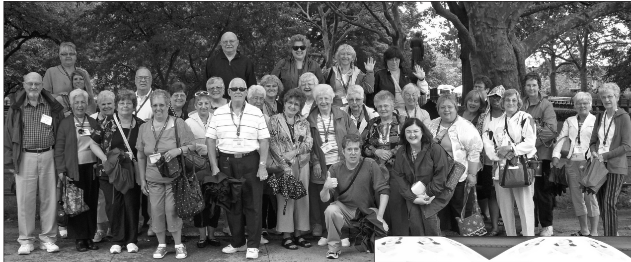
They loved New York. Members visited the Statue of Liberty, Times Square, Central Park, Rockefeller Center and Wall Street. New York Harbor Cruise made this an incredible trip.