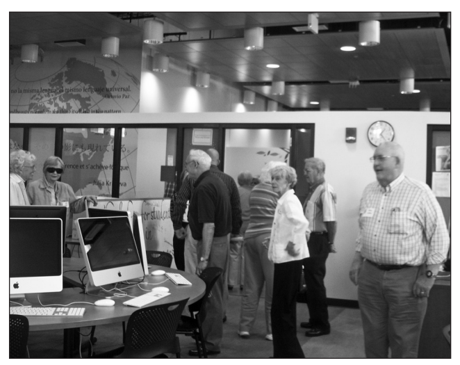
Everyone was impressed with the newly renovated Memorial Field House.