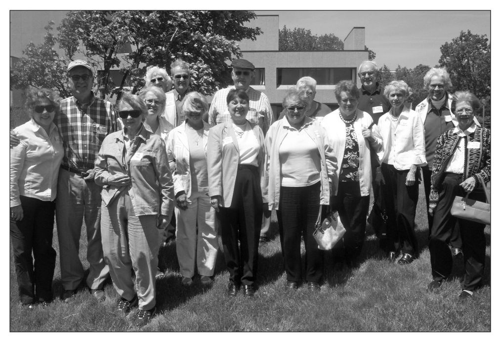
Retirees tour UT campuses. Photo taken on the Health Science Campus.