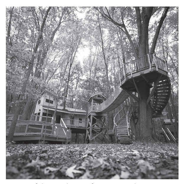
One of the tree houses for rent at Oak Openings Metropark.